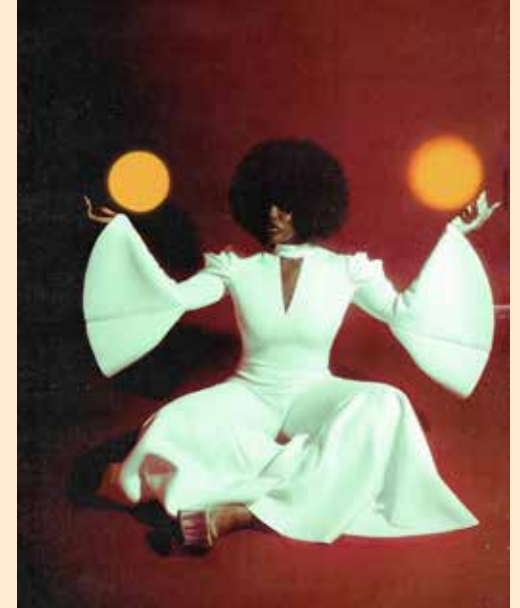
Las Brujas in Spanish translates to "The Witches".